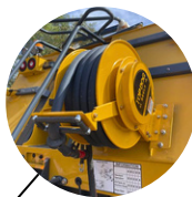
15m spring reel hose