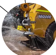
Left and right dribble bar