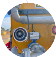
Water main filling