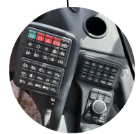
Push button configuration