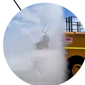
Side batter spray heads