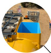
Overhead filling capability