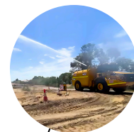
Cab controlled water cannon