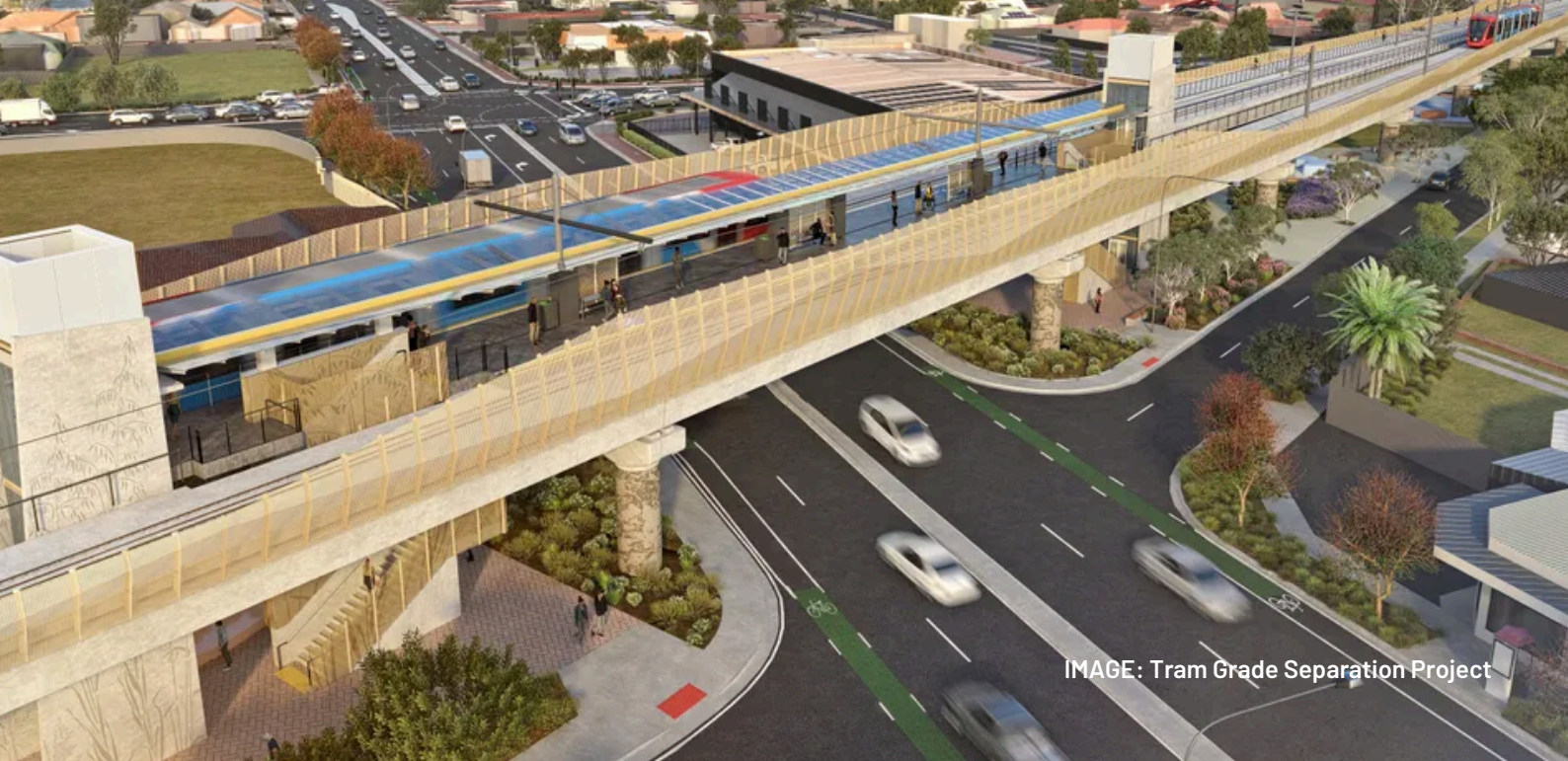
IMAGE: Tram Grade Separation Project